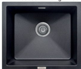
S30051 - Midnight Black