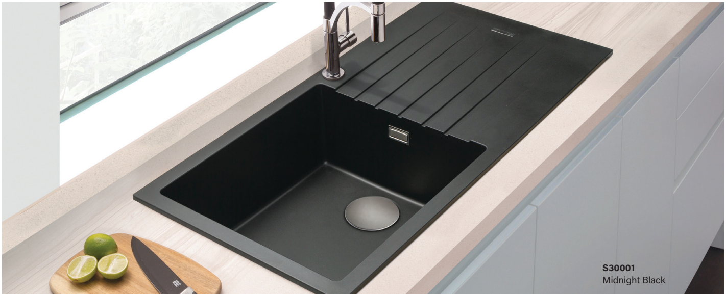
S30001 Midnight Black