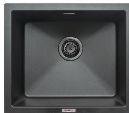
S30052 - Gunmetal Grey