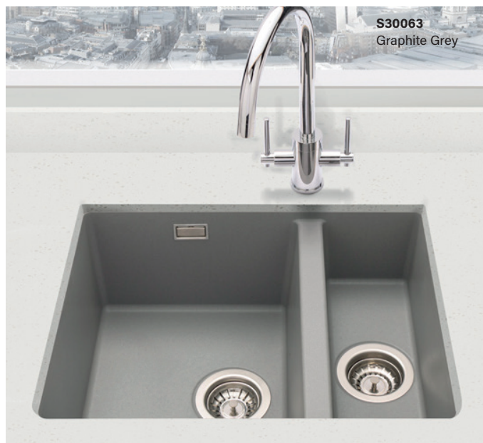
S30063 Graphite Grey