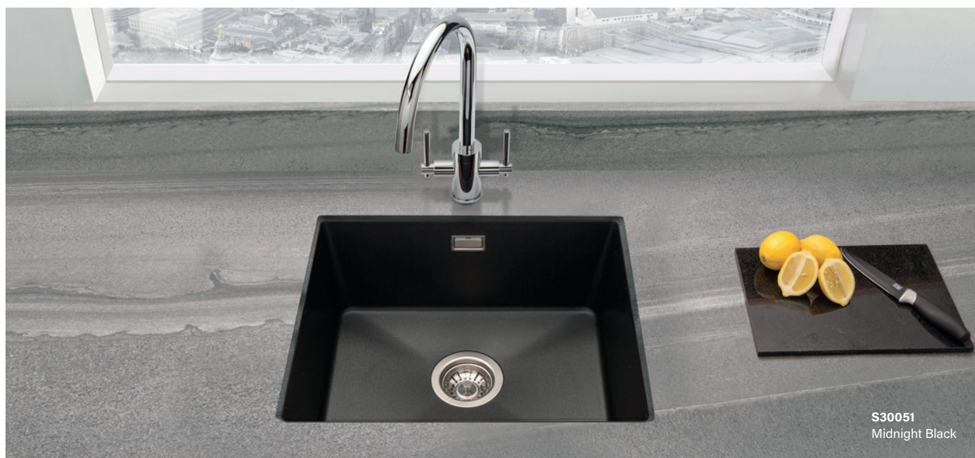
S30051 Midnight Black