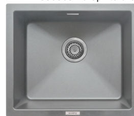
S30053 - Graphite Grey