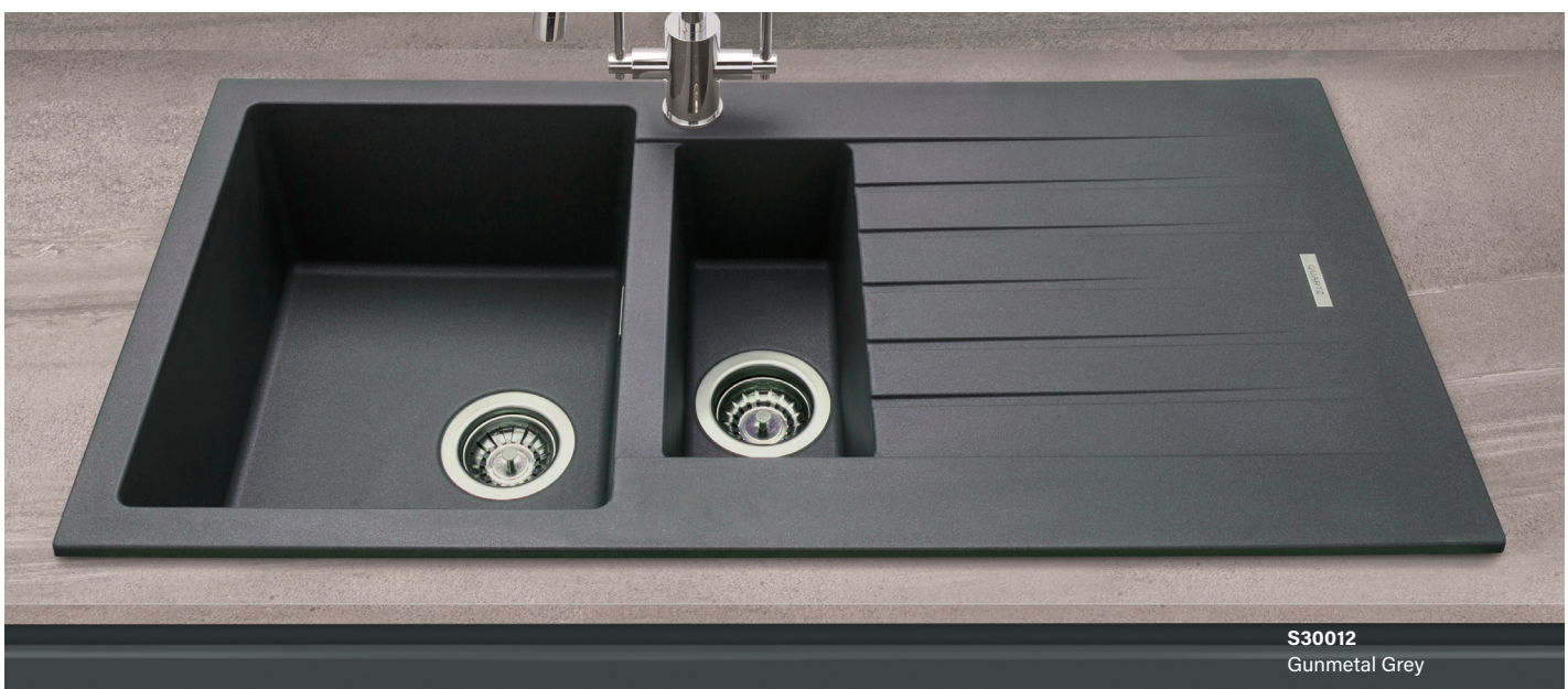
S30012 Gunmetal Grey